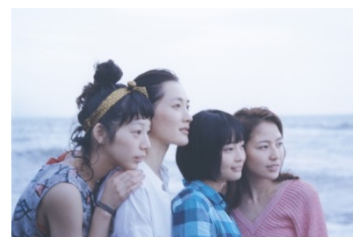
Our Little Sister

The Best Film winner of the 39th Japan Academy Prize will be screened with Japanese subtitles as well as audio guidance.