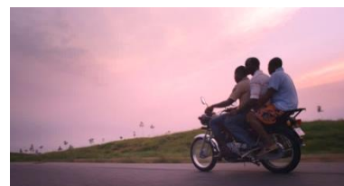
Out of My Hand

Women in Oversized Men's Shirts (Yngvild Sve Flikke/Norway/Asian Premiere)