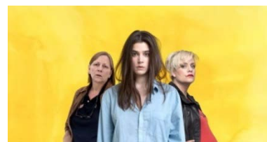
Women in Oversized Men's Shirts