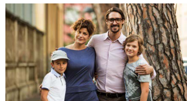
My Family Jumble